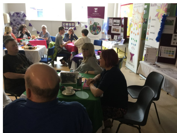
Warrington launch event at Fairfield and Howley Neighbourhood Project