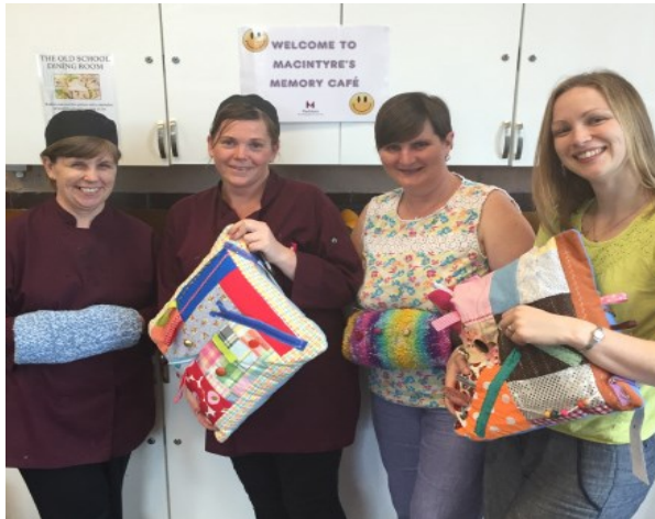
Staff at the Warrington Memory Café in July