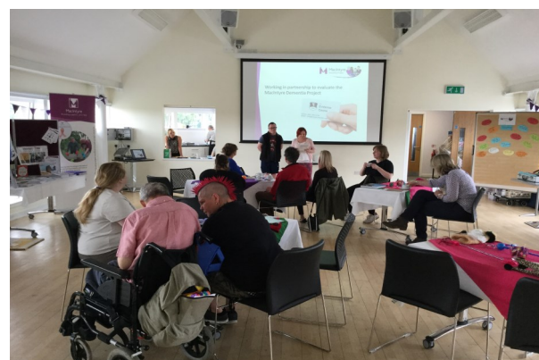
Milton Keynes launch event at Great Holm