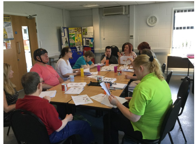
The group are compiling an Easy - Read booklet on ‘Respect’

We hold a focus meeting in Chesterfield, once a month called “Keep Going……. Don’t Stop!”. This is a group to ensure the voices of people supported by MacIntyre are heard.