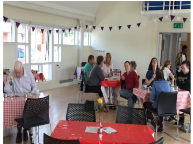
Milton Keynes Memory Café at Great Holm

Tell us about your ideas and what works well