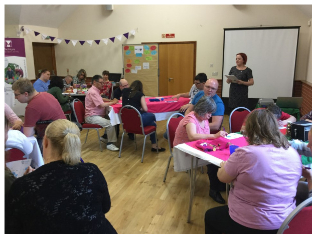
Dementia Friends sessions help to give people a better understanding of dementia

Thank you to everyone who came along and made the days so successful!