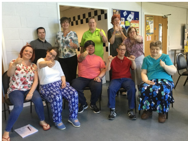
The group at their July meeting in Chesterfield