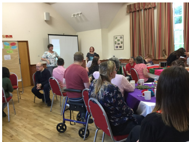
The Bedfordshire launch event on 24th June at Millbrook Village Hall