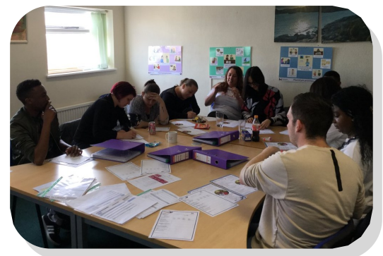
Above - MacIntyre staff members attending the Health Recording Training