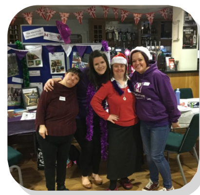
Above: The Health Team

In December 2017 we visited the infamous MacIntyre Roadshows, having two stands one dedicated to Health where we had fun activities and a pin board to write down and share our favourite, yummy, healthy recipes. The other stand was dedicated to the Dementia Project which included sharing our fondest memories whilst crafting Christmas cards and gift tags. It was an incredible few days, and was fantastic to meet and share the work we have done with everyone and their families. We are working hard on our ideas for the stands for this year so please be sure to come and stop by and say hello.