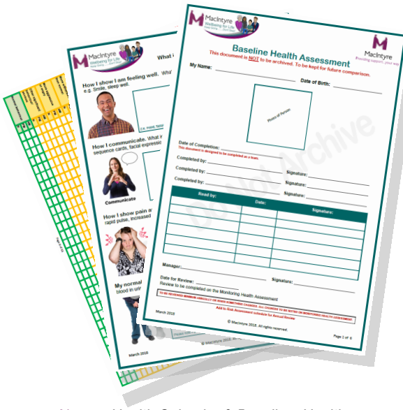
Above - Health Calendar & Baseline Health Assessment documents

What a busy time it's been implementing the Health Calendar and supporting documents across all of MacIntyre. We have successfully visited lots of services across MacIntyre, on a nationwide tour running Health Recording workshops face-to-face to support staff teams. The workshops give you the chance to ask questions and leave with confidence that you understand how to use the Health Calendar and health recording documents within your service. However if you are struggling or need help, please just ask.