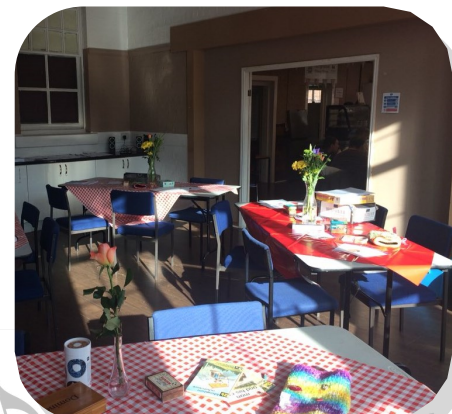
Above: Warrington Memory Café

If you are supporting someone with a diagnosis or suspicion of dementia the Memory Cafés are the perfect place to visit - in Milton Keynes & Warrington we have a really close relationship with the local Admiral Nurses, who attend the Cafés each month to offer support and advice. They have a wealth of knowledge and experience around dementia so please take advantage of that and come visit! If you are interested in opening a Memory Café in your area and would like some advice and guidance of how to set one up or if you have any question at all about the Memory Cafés or the Admiral Nurses, please do get in touch we would love to hear from you. memory.cafes@macintyrecharity.org