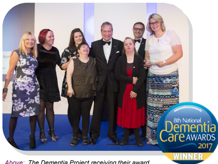
Above: The Dementia Project receiving their award